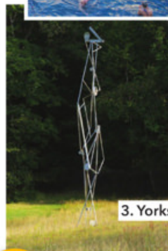
3. Yorkshire Sculpture Park