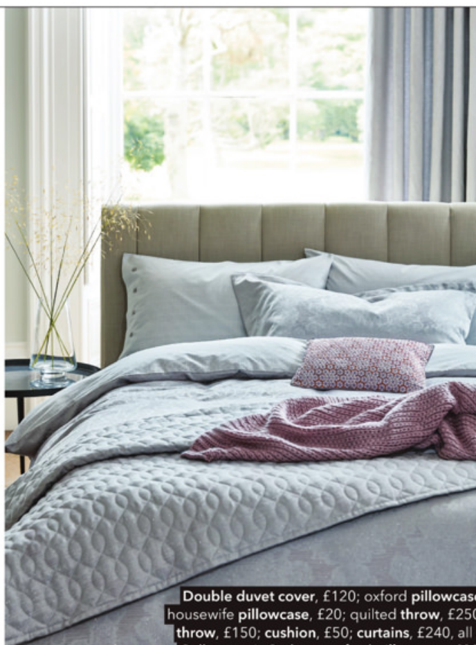
Double duvet cover, £120; oxford pillowcase, £25; housewife pillowcase, £20; quilted throw, £250; knitted throw, £150; cushion, £50; curtains, £240, all Allegro Collection 1. Cadenza oxford pillowcase, £20 2. Eris oxford pillowcase, £20 3. Zeya quilted throw, £150, all Bedeck of Belfast