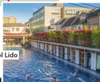
2. Bristol Lido