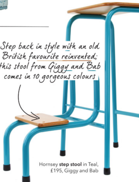
Hornsey step stool in Teal, £195, Giggy and Bab

Step back in style with an old British favourite reinvented; this stool from Giggy and Bab comes in 10 gorgeous colours