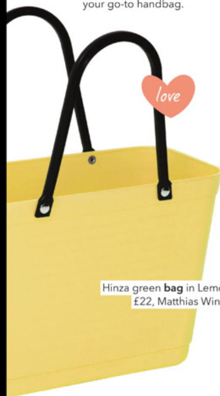
Hinza green bag in Lemon, £22, Matthias Winter

This environmentally-friendly version of the classic Swedish Hinza bag is made from green plastic, a renewable raw material sourced from sugar cane. Wipe-clean, versatile and available in five colours, use as sustainable storage or your go-to handbag.