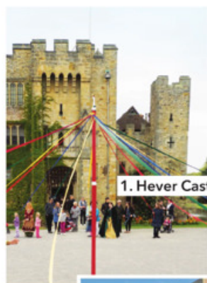
1. Hever Castle

A natural twist on the classic condiment, Pear Drop London's range of Wild Ketchups are made from ingredients gathered year-round from across the British countryside. Flavours include this green tomato, nettle and pear, plus beetroot, blackberry and black pepper.