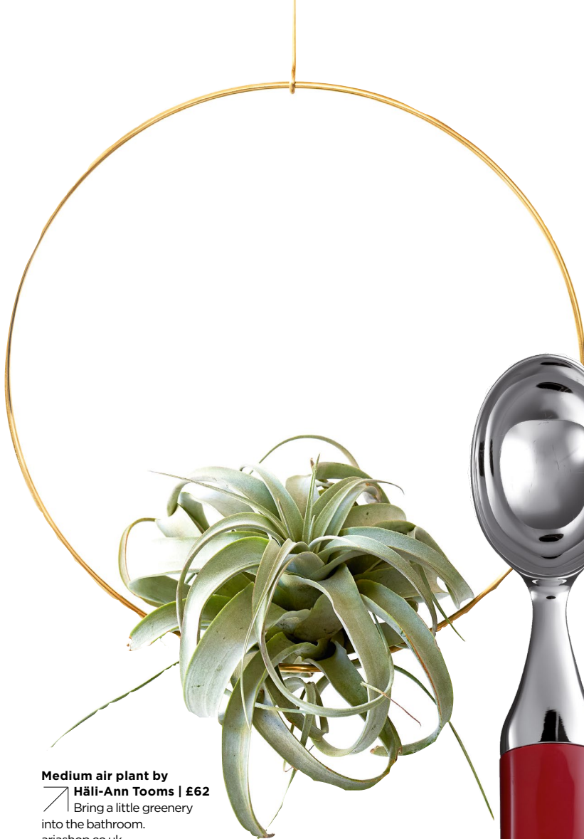
Medium air plant by Häli-Ann Tooms | £62 Bring a little greenery into the bathroom. ariashop.co.uk