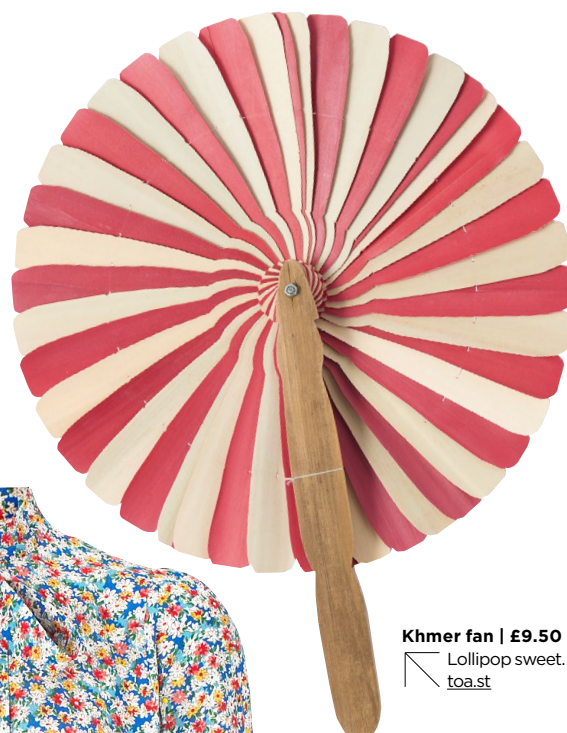
Khmer fan | £9.50

With a tactile tier of velvet. rockettstgeorge.co.uk