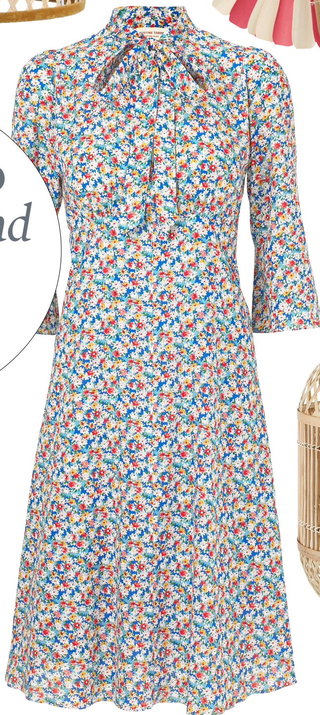
Cotton Chloe dress | £195