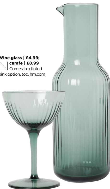
Wine glass | £4.99; carafe | £8.99 Comes in a tinted pink option, too. hm.com