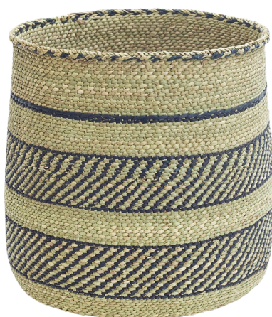
Iringa basket | £45

Thirties-inspired prettiness in floral cotton. justinetabak.co.uk