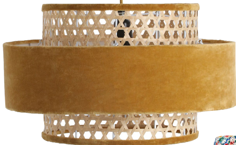
Velvet & Rattan pendant ceiling light | £185

With a tactile tier of velvet. rockettstgeorge.co.uk