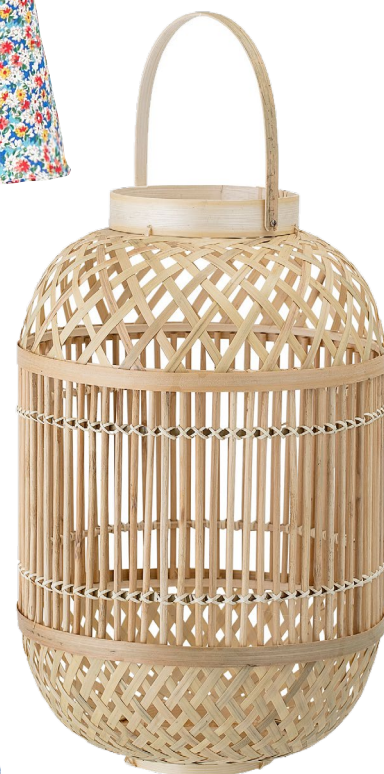
Bamboo garden lantern | £53

Textured storage tub with neat stripes. oggetto.com