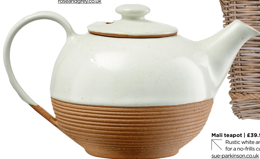
Mali teapot | £39.95

Screen printed by hand, you'll be glad you invited these eco-friendly cork mats for tea. Available in three patterns. inclusivetrade.com