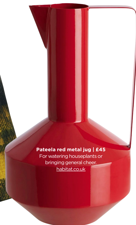
Pateela red metal jug | £45 For watering houseplants or bringing general cheer. habitat.co.uk