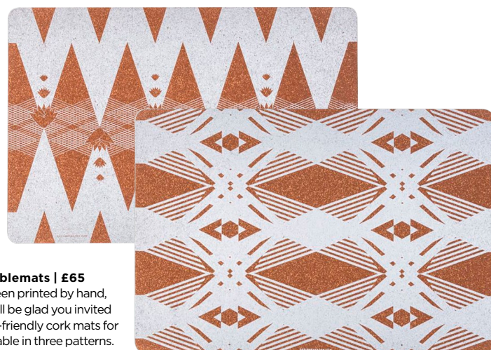
6 cork tablemats | £65

Cheer a wall in a quiet way with a pared-back rainbow. roseandgrey.co.uk