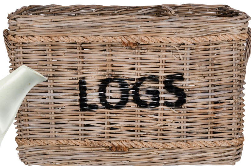
Log basket | £120

Rustic white and terracotta pot for a no-frills cuppa. sue-parkinson.co.uk