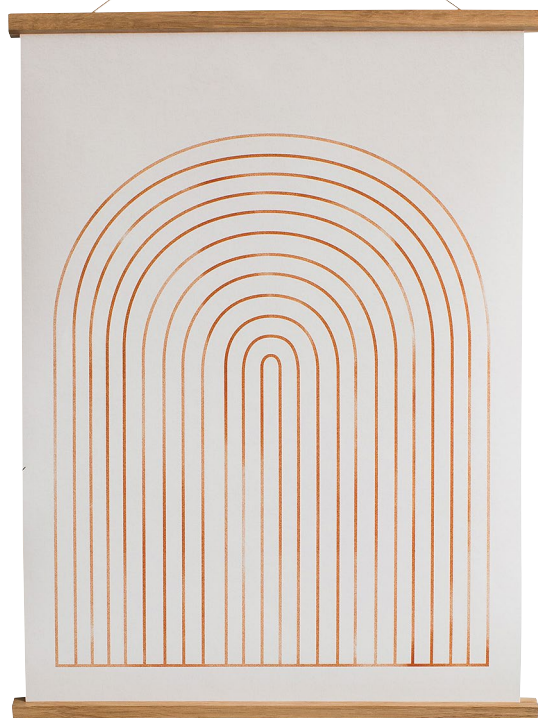
Rainbow on White Forn Studio print | £45

Cheer a wall in a quiet way with a pared-back rainbow. roseandgrey.co.uk